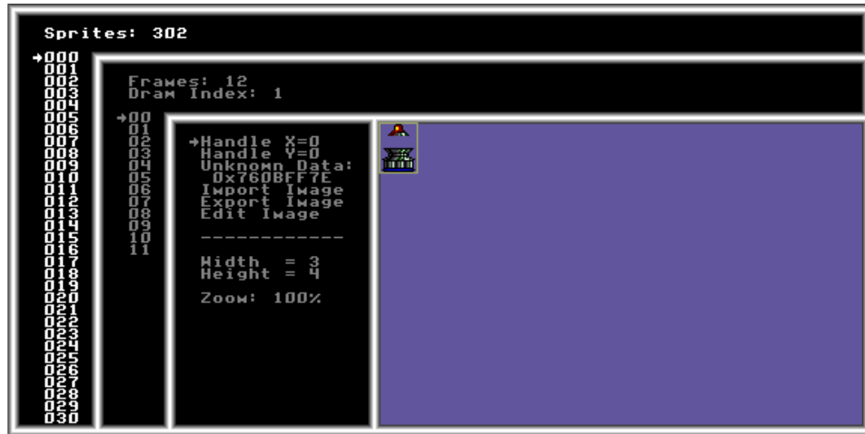
Figure 1.1.: The Sprite Editor's Edit Mode

is bad), or you might not be able to save the sprite file anymore (which might be worse). Make sure that the following is always true: