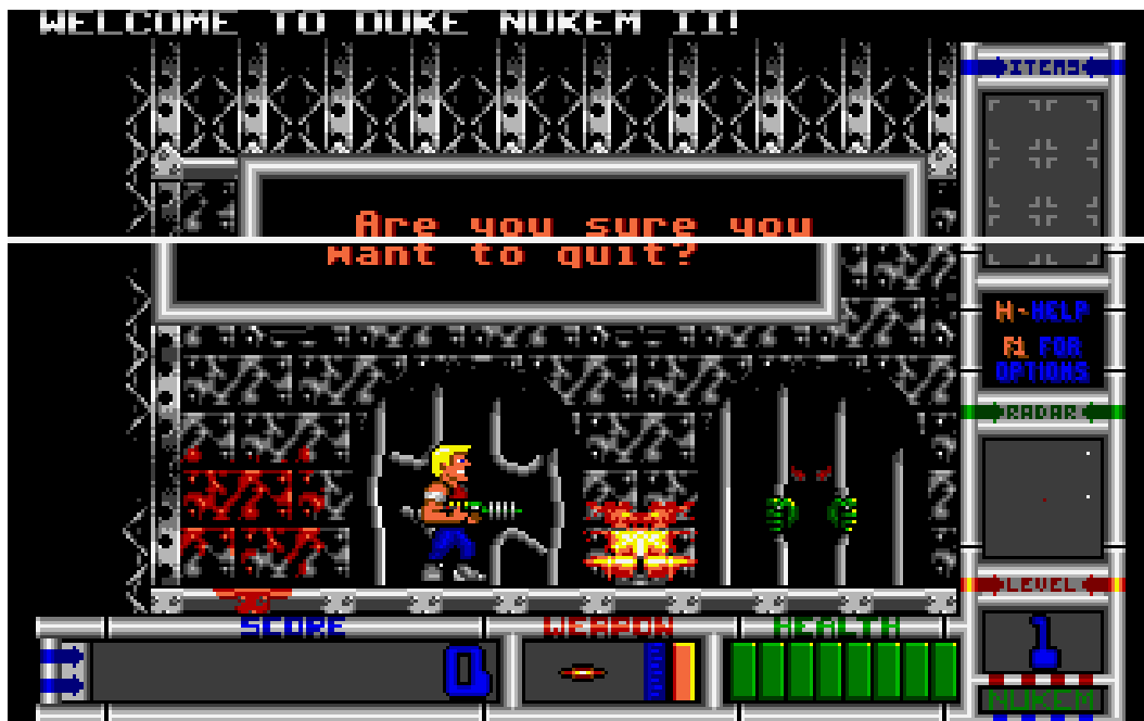
Figure 2.2.: Shifted And Unshifted Centered Windows